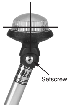
Note: Clear Globes Must Be Vertical During Operation.