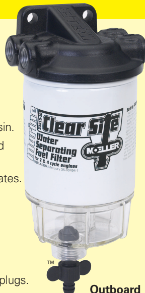
Outboard Part No. 033314-10

WARNING • Outboard engine use only! • Not for use with diesel fuel!