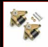
E-Z Flex® Equalizer & Bolts Kit