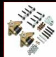
Complete E-Z Flex® Suspension Kit