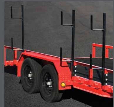
PIPE UTILITY RACK