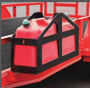
DUAL 5 GAL. GAS CAN RACK