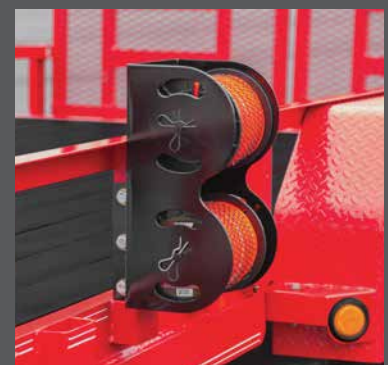
TRIMMER LINE RACK

To learn more and see all the Ready Rail® accessories visit: www.pjreadyrail.com