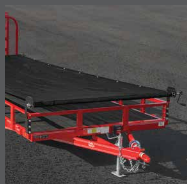
MESH TARP KIT