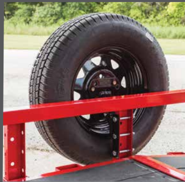
SPARE TIRE MOUNT