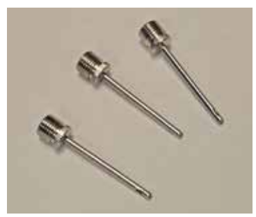
TMP # 1005 Hand Pump