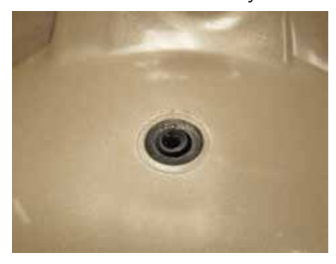
Tri-Valve (White) - Removable using a #2 Phillips head screwdriver